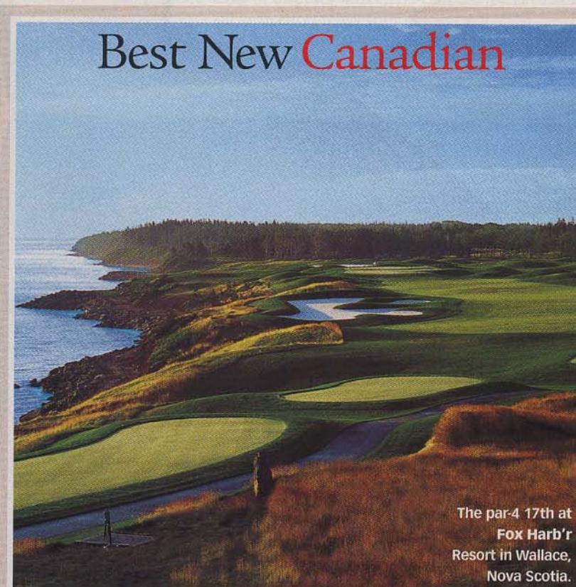
The par-4 17th at Fox Harb'r Resort in Wallace, Nova Scotia.

1 Fox Harb'r Resort* Wallace, Nova Scotia. 7,205 yards, par 72. Graham Cooke, designer. 902-257-1801. www.foxharbr.com *Walking anytime